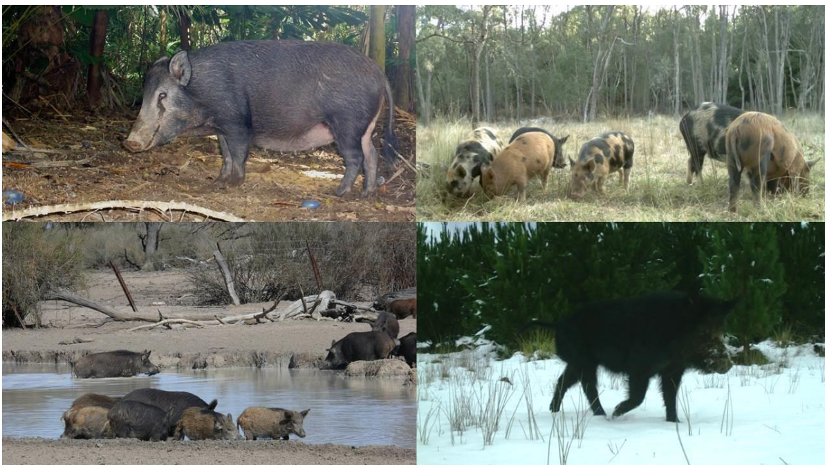
Figure 1. Feral pigs occupy a wide range of habitat types in Australia.