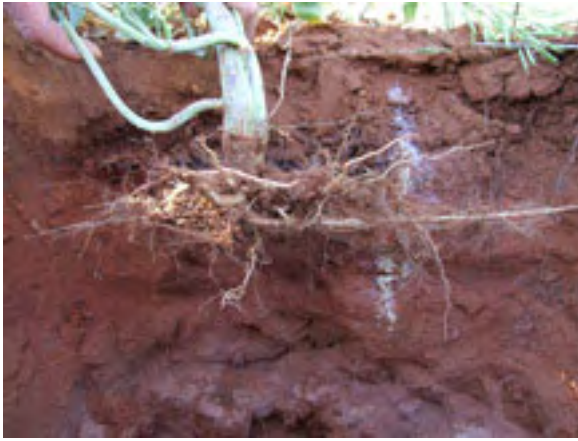
Figure 4. Subsoil constraints such as hard pans can severely restrict root development, access to subsoil moisture, and hence yield.

Subsoil moisture. Juncea canola plants respond very well to subsoil moisture, especially when sown early into well structured, fertile soils. The plant's vigorous tap root system is able to extract moisture from deep within the profile, allowing the crop to be better buffered against the hot, dry conditions which can occur in spring. For this reason, it is important to select a paddock with good subsoil moisture. Aim to sow into a paddock with at least 70 cm of subsoil moisture. It is also important that there is enough moisture in the seedbed as juncea canola needs slightly more moisture than cereals for germination and establishment. In the low rainfall cropping zone the best moisture will be in a long fallow paddock (18 months), which should also be a cleaner paddock for weeds and diseases.