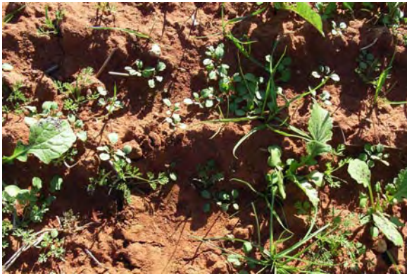
Figure 6. Broadleaf weeds such as mustard species and fumitory can be a problem in juncea canola.

Grass weeds can be easily controlled post-emergence by Group A 'fop' and 'dim' herbicides, so long as weeds are not resistant to this chemistry.