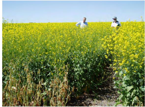
Figures 1 and 2. B. juncea varieties are being developed for different end-uses.

the desirable oleic acid and low levels of erucic acid, and the meal can be substituted for canola meal in animal diets (low glucosinolates).