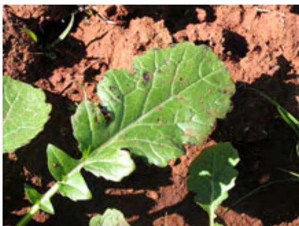
Figure 8. Dark spots are common on B. juncea but do not affect yield.

Direct heading. Juncea canola can be direct headed as it is less prone to shattering than canola. Direct heading is more suitable for crops that mature evenly and are not excessively tall. Draper fronts with batt reels seem to be best suited for direct heading. Once the crop is ripe for harvesting, delays must be avoided as juncea canola will still shatter if adverse conditions prevail.