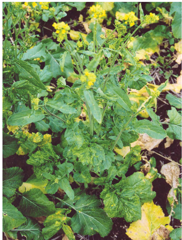
Figure 7. Viruses diseases such as Turnip mosaic virus are more prevalent in northern NSW.

All insecticides registered for canola are approved under permit (PER9343, expiry 3/03/2012).