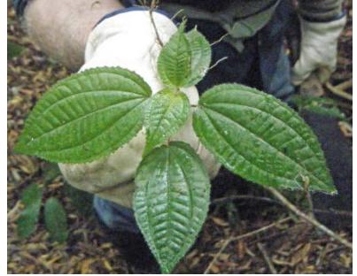
Koster's curse (Clidemia hirta)

Full profile: http://weeds.dpi.nsw.gov.au/Weeds /kochia